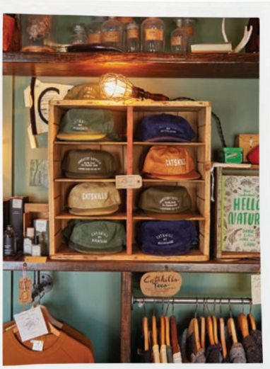
ABOVE: Part of the proceeds from the store's Catskill Mountainkeeper Collection, which includes wool caps and organic cotton sweatshirts, benefits the organization of the same name, which protects the region's wild lands. Shop the inventory online at homestedt.com.