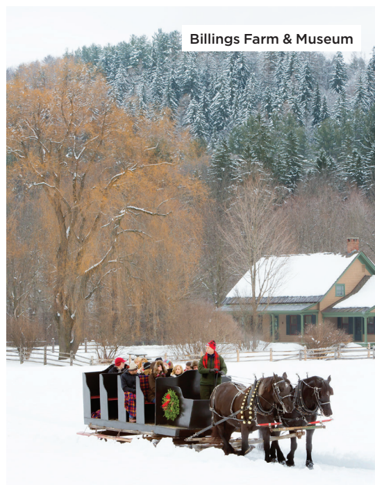
Billings Farm & Museum

For our complete guide to Woodstock, Vermont, visit countryliving.com/woodstock-vt .