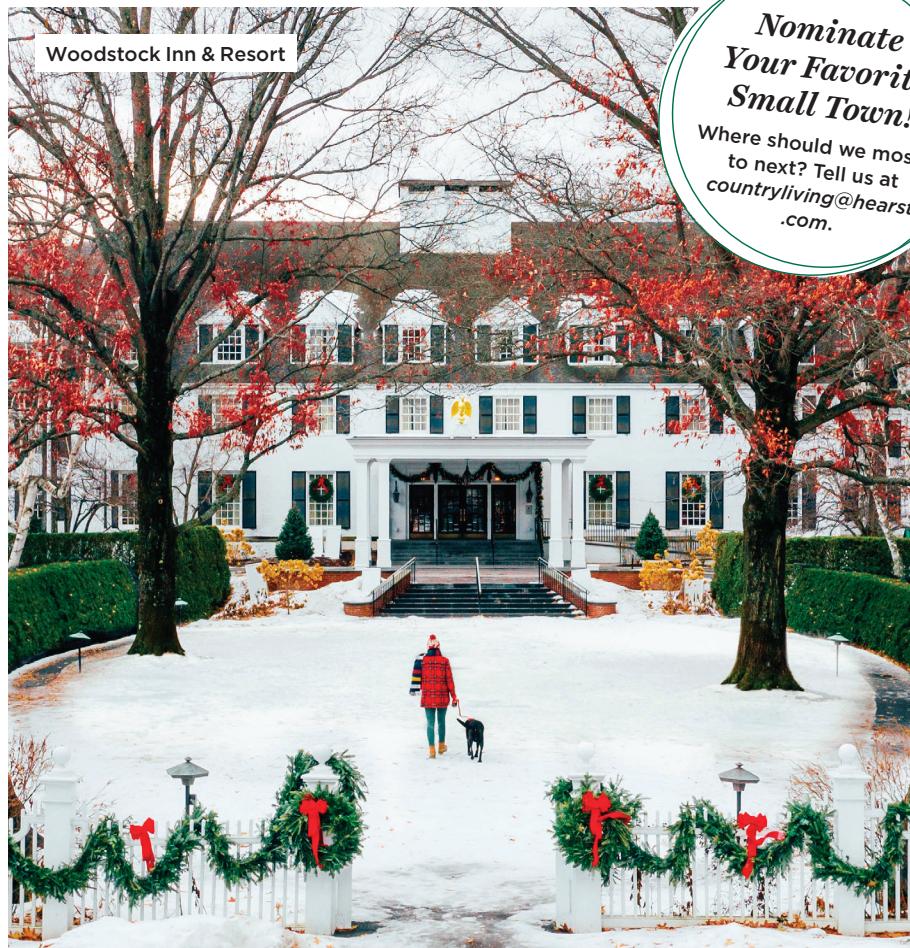
Woodstock Inn & Resort