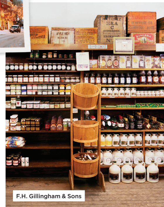
F.H. Gillingham & Sons

Rise and Dine: Start the morning at Mon Vert Cafe , which serves Vermont Coffee Company brews and breakfast specialties like the Monte Vert Cristo: ham and Cabot Swiss cheese on challah French toast with a side of local maple syrup.